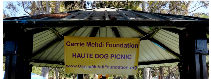
"1st Annual Haute Dog Picnic", May 11, 2013