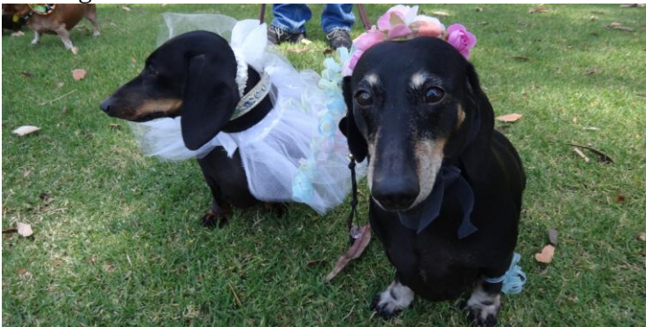
Dogs get ready for the canine crazy hat contest.