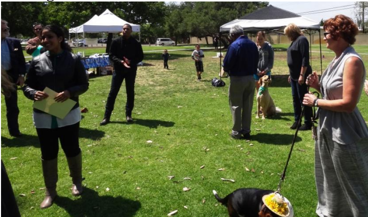
Contestants showing to judges for Crazy Hat contest.