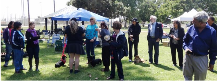
Guests meeting and greeting.