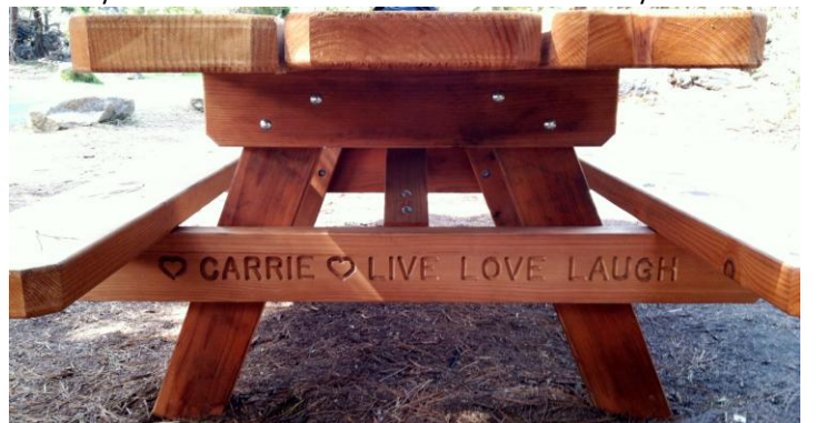
***** BLAST FROM THE PAST *****